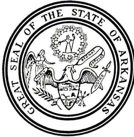
GREAT SEAL OF ARKANSAS